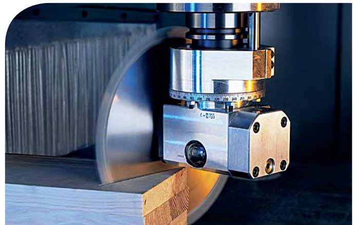
A powerful CAD/CAM solution for wood processing.

TopSolid'Planner (parts lists, log sheets, optimization of panels, machining program, etc.).