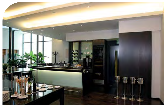
TopSolid®Wood meets the needs of designers, manufacturers and sub-contractors in the wood working sector (image: Victoria Jungfrau Interlaken, Strasser AG Thun, Triviso AG Solothurn).