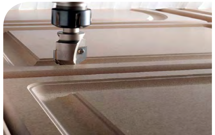
Designs made to be manufactured - TopSolid®Wood has been developed for use in a manufacturing environment and is completely integrated with TopSolid®WoodCam.