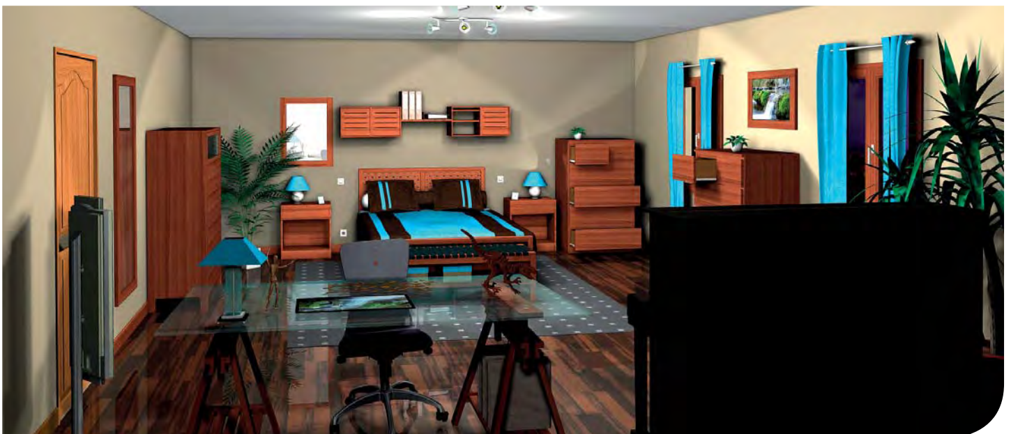
Interior design realized with TopSolid'Wood.